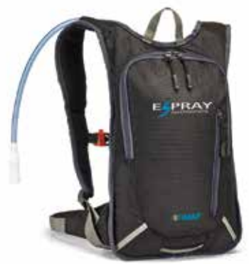
Optional Long Range backpack with additional 2-litre tank

The strength of the charged particles is greater than that of gravity, so they are immediately attracted by the surface and do not fall to the ground.